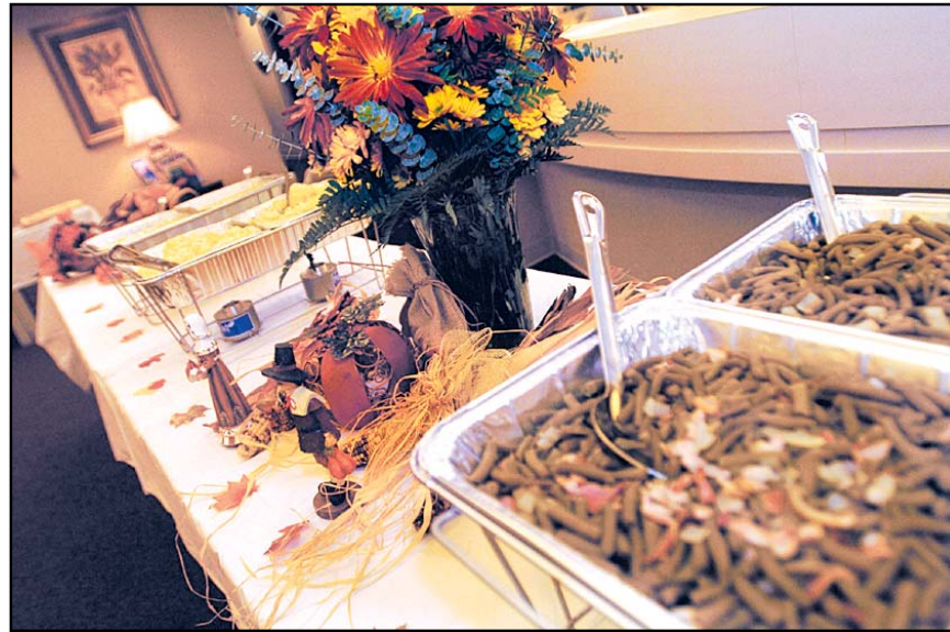
Regional Urology staff always prepares or has a meal catered for the monthly meetings.